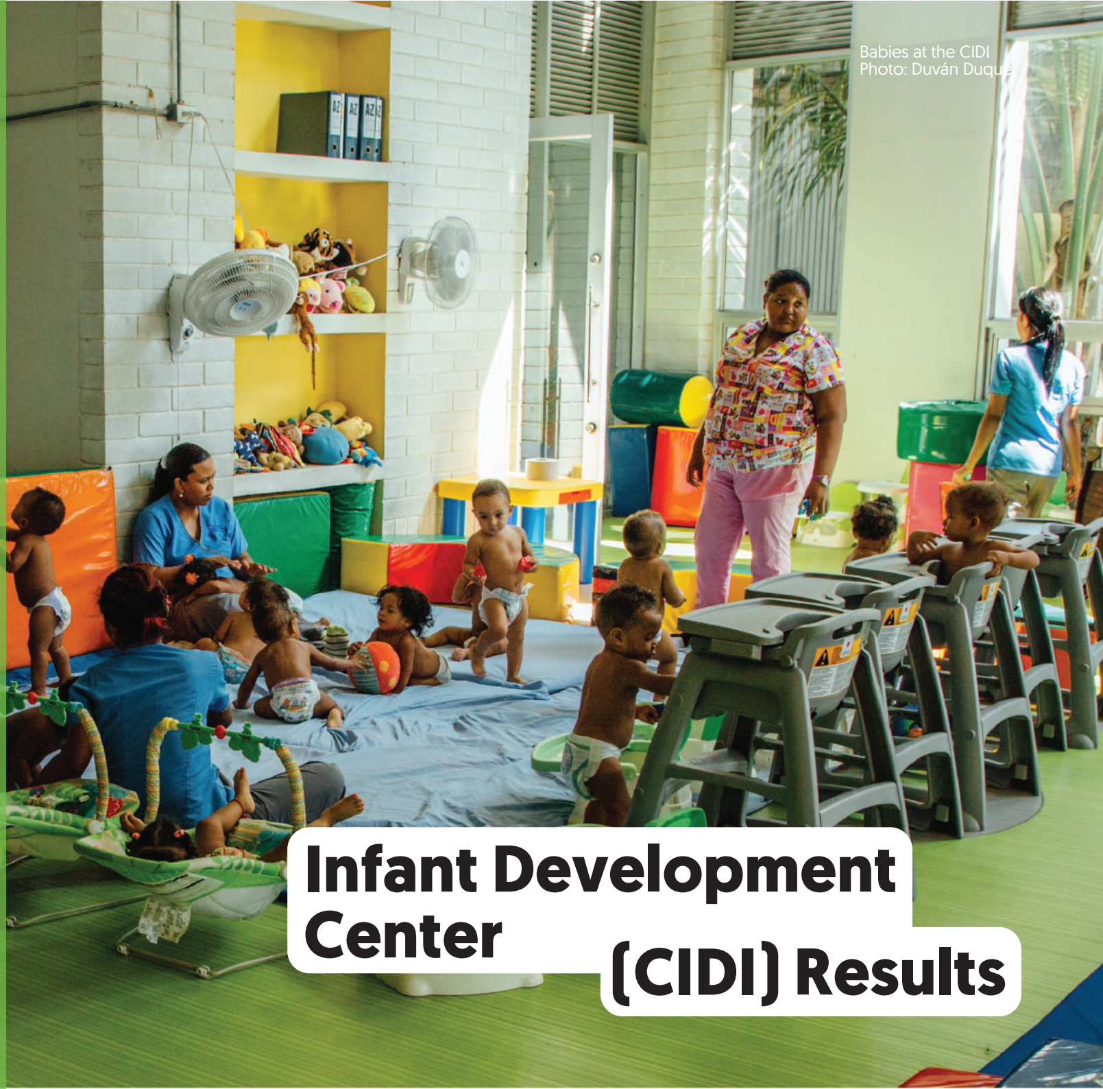
Babies at the CIDI