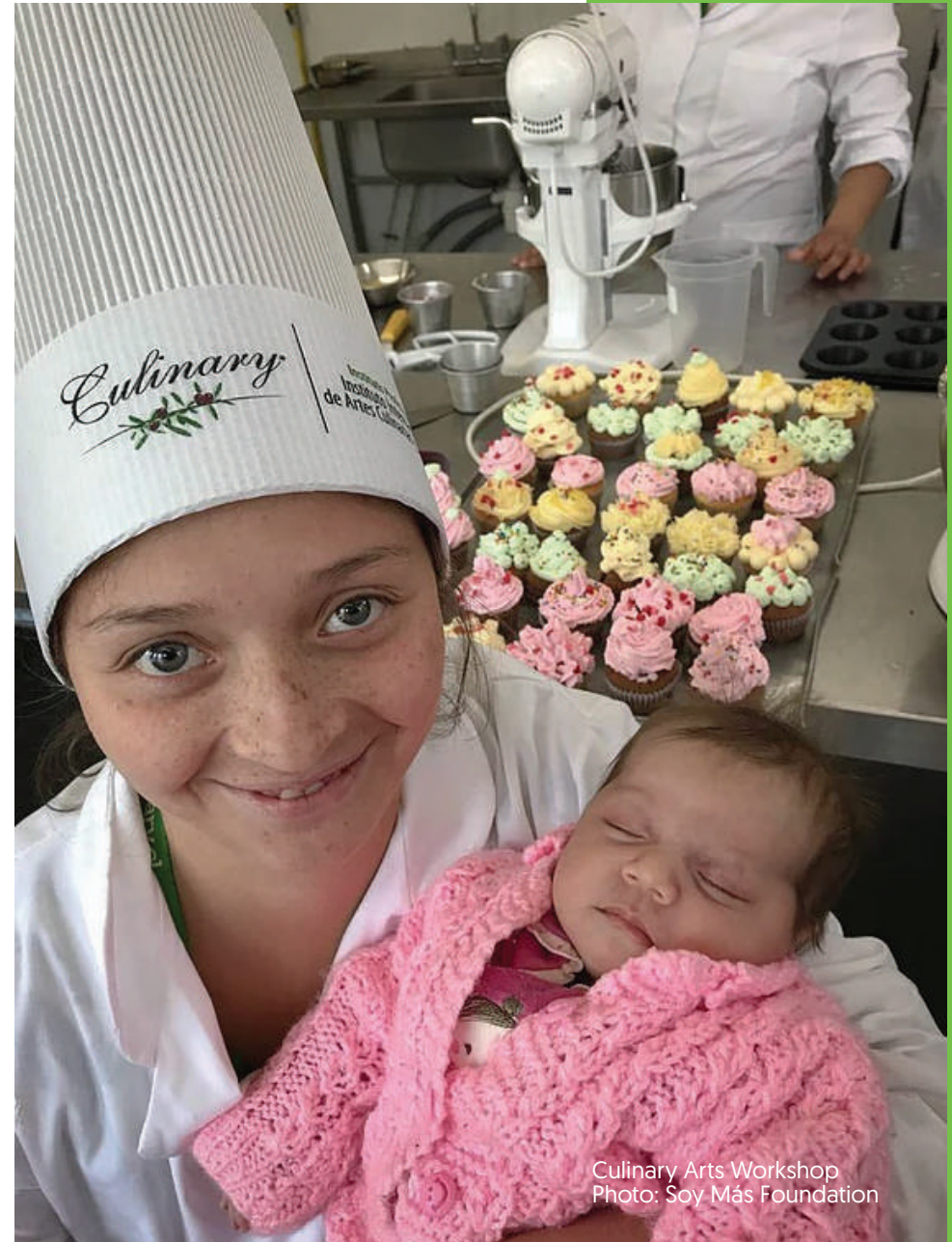
Culinary Arts Workshop

Next semester there will be 20 new beneficiaries, and 20 more on the second semester.