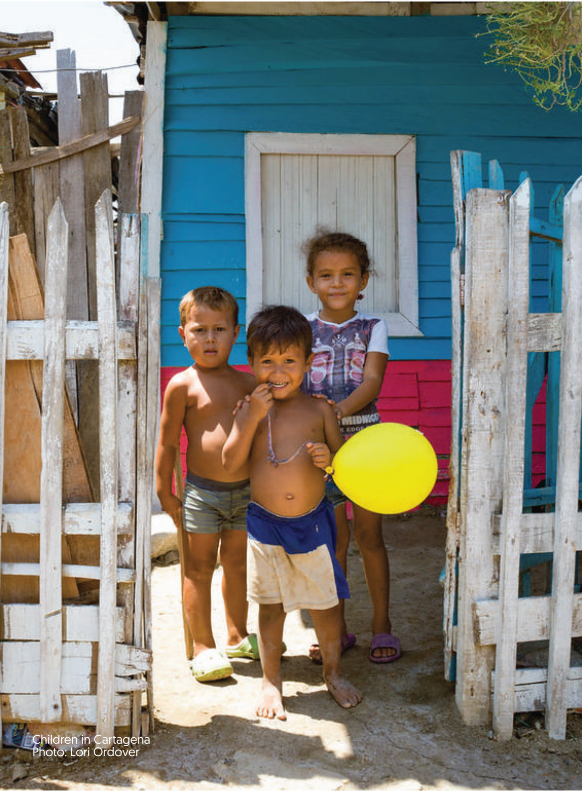
Children in Cartagena