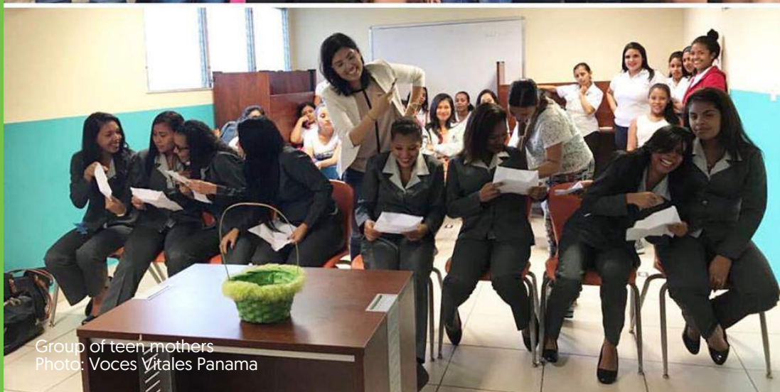
Group of teen mothers

The objective of this project, which is adapted from Juanfe's intervention model, comes from the need to address the problem of teenage pregnancy that affects 20% of girls in this country.