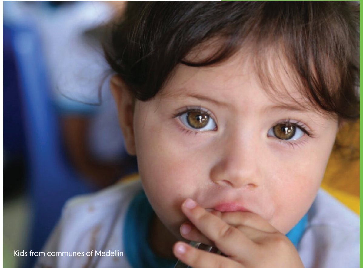
Kids from communes of Medellin

Juanfe Medellin will start working with 100 teenage mothers in August 2018.